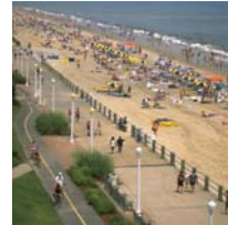
Separated with Landscaping