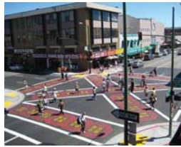
Painted / Art