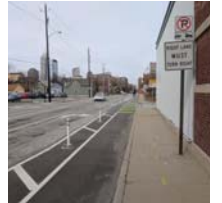
Protected with Buffer