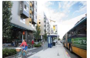
Traditional - Protected Bicycle Lane Integrated