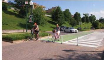
Dual Crossing: Green = Bicycles / White = Pedestrians