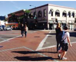
Diagonal / Scramble