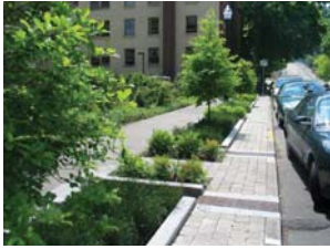
Planting - Integrated Stormwater Systems